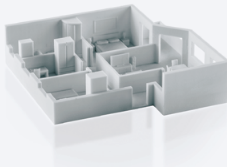
Apartment cross-section model