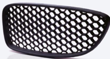
Car grille prototype