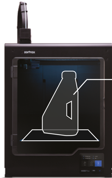
Zortrax M300 Plus 3D printer